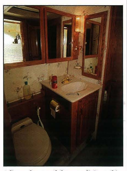
A linen closet and three medicine cabinets grace the commodious bathroom.