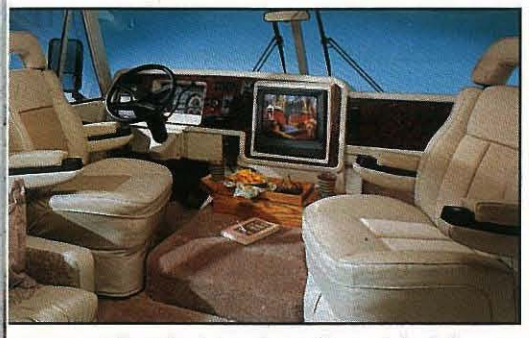
The television is easily watched from any spot in the living area.

The presence of a tag axle on the Classic 360 no doubt contributes to its on-road stability. The Henschen tag axle features a rubber-torsion independent suspension setup and