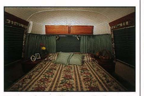
Open and airy, the master bedroom is reminiscent of a luxurious stateroom.