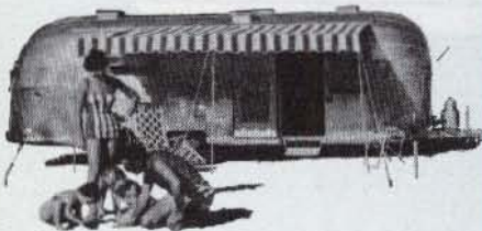
Airstream—since 1932 the world's finest lightweight travel trailers

Here is a special version of the popular standard Flying Cloud—specifically designed for a travel twosome. Naturally this allows greater flexibility in interior arrangement, plus the addition of many unique features. You must see this unusual model to appreciate it. You'll be amazed by the feeling of roominess... and actually, many things are larger—a spacious living room; larger bathroom with separate shower, toilet and wash basin; much larger storage area. Nothing has been spared to bring you greater comfort and convenience than ever before in a 22 ft. model. Remember, too, that every other exclusive Airstream feature of the Flying Cloud is also included in this sleep-two model—comfortable beds; double sink and lots of formica for easy-to-clean convenience; oven and broiler stove; combination ice-electric refrigerator. Be sure to see and test-ride a Flying Cloud sleep-two for enjoyable trailering. Just hitch it to your car and you're ready to go at a moment's notice wherever your heart desires.