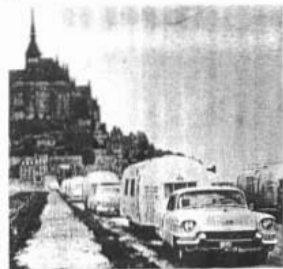
Wally Byam Caravan at Mont St. Michel, France

Perfection of the INTERNATIONAL didn't occur overnight. Thousands of ideas and items were tested in a search for the ultimate. For instance, you flip a switch and a light floods the area—quietly, softly, brightly. Years of experimenting lie behind that light! Noisy generators; American, European; high and low voltages; gas lights, oil lights—all discarded for this one bit of foolproof perfection.